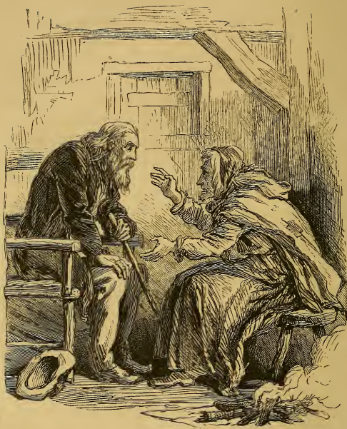
THE GYPSY FORTUNE-TELLER.